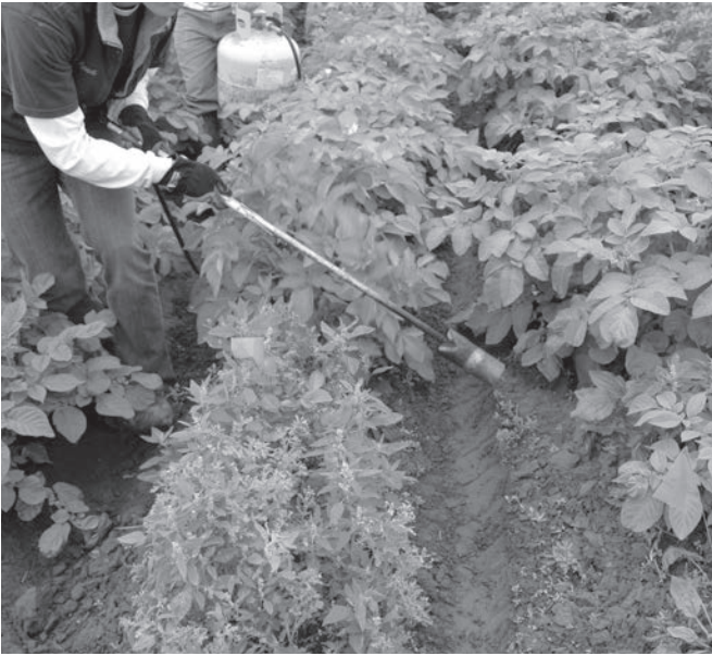
Flame weeding controls weeds within the potato row and on the sides of raised potato beds.

bers while effectively killing the weeds. Using a chopping action to remove the weed roots or pulling entire weeds by hand can damage the tubers.