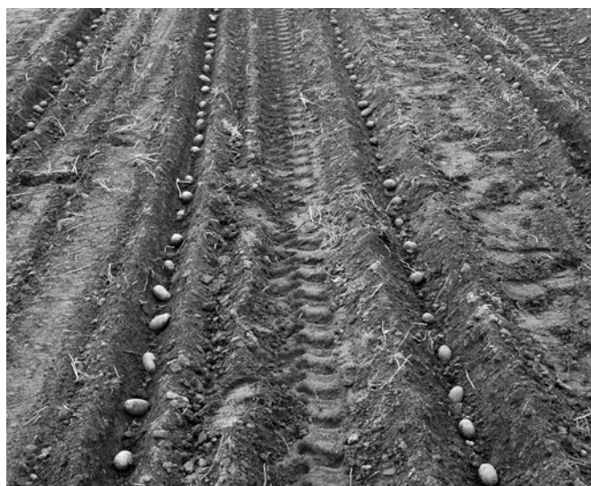
Seed potatoes can be planted in furrows (above) or mounds.

gardeners pay no attention to seed piece orientation in the soil.