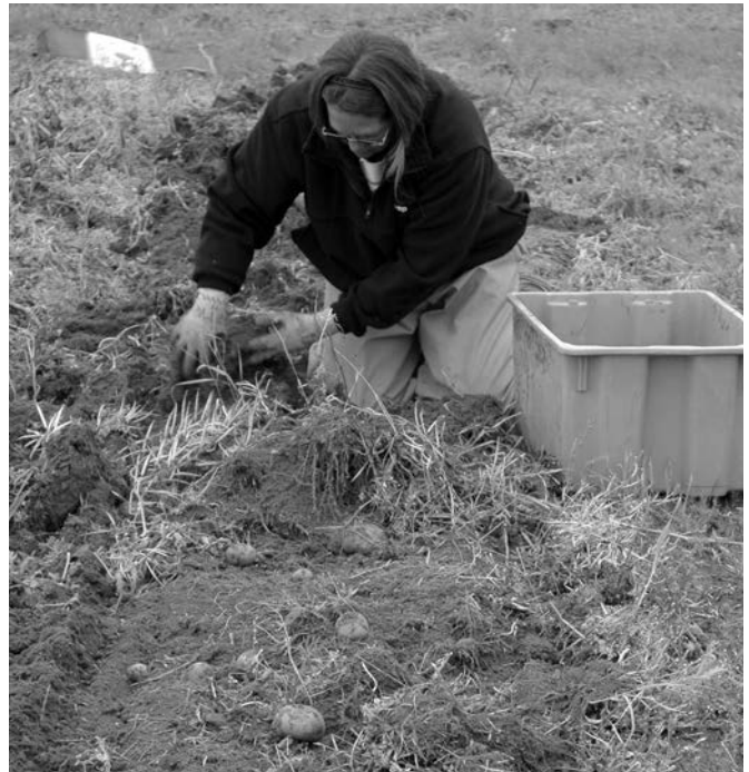
Potatoes can be harvested both during the growing season and at the end of the growing season.

Single drop seed pieces are small potatoes, 1 to 2 inches in diameter, which are planted whole. Some gardeners will pay a premium for single drop potatoes because they do not need to be cut be-