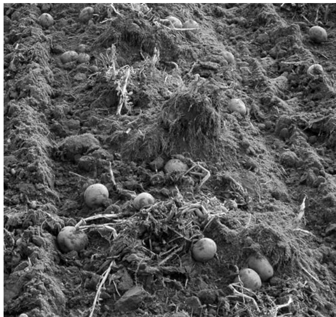
Cutting back the vines one to two weeks before harvest allows the potato skin to toughen before storage.

While the optimal storage condition for potatoes is a dark, cool, high humidity area, most homes are not equipped to meet the exact storage standards used by commercial producers. Simply storing your potatoes in a cool place where they are not exposed to light or at risk of freezing will suffice for a few months. If the potatoes freeze, they will fall apart once they are thawed and become inedible. A few